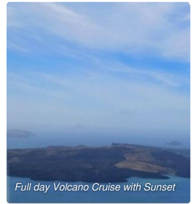
Full day Volcano Cruise with Sunset