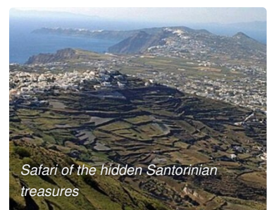
Safari of the hidden Santorinian treasures

Lunar landscape at Eros beach will offer you unforgettable views.