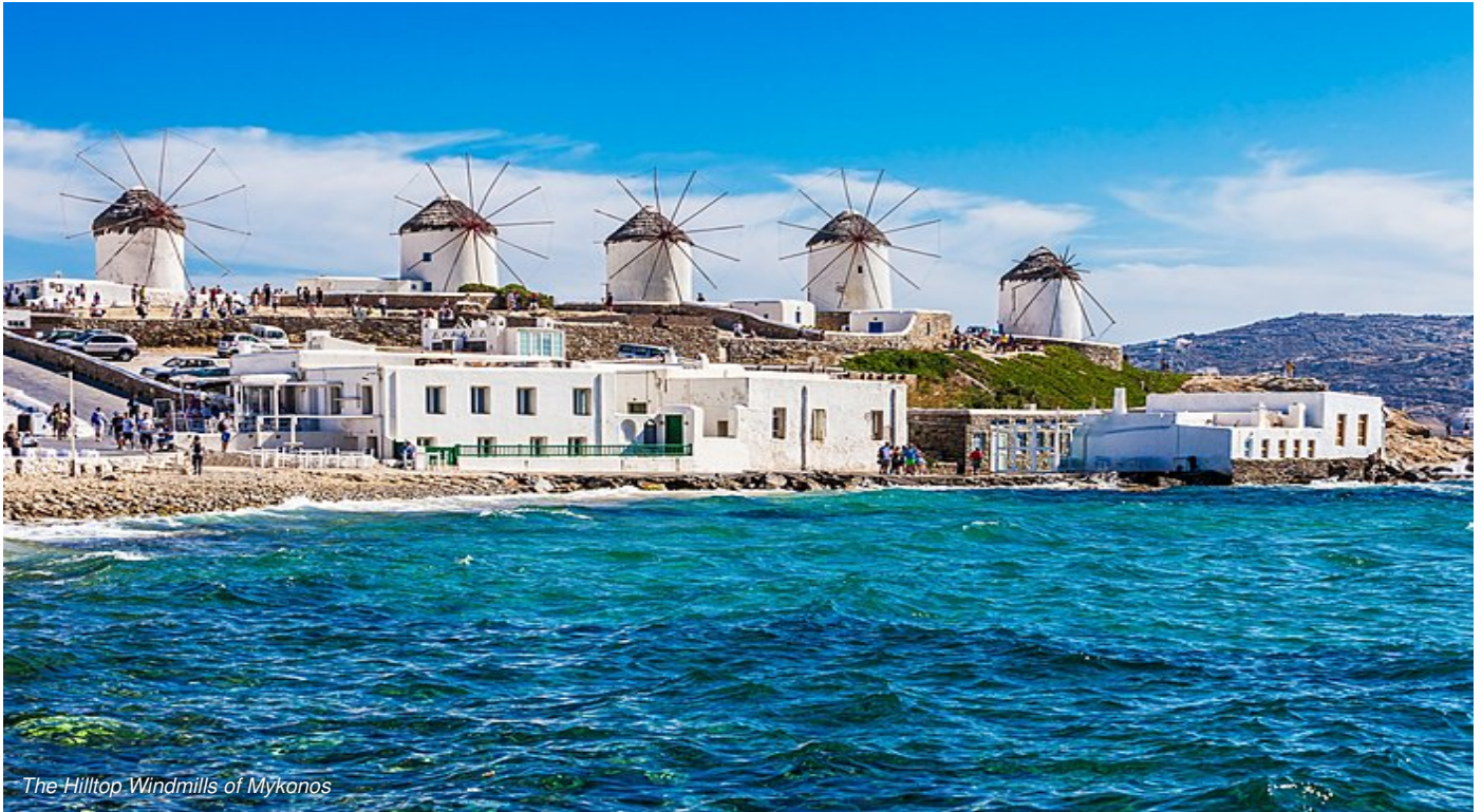
The Hilltop Windmills of Mykonos

Known for its jetsetting reputation and signature windmills, Mykonos , with its nightclubs and the fetching blue-and-white buildings of the Little Venice neighborhood, is among the most famous of the Greek islands, and has the crowds to match. This Cycladic island is a cosmopolitan spot, with plentiful clubs, restaurants, and designer shops. Visitors can tour either the hotspots of the main town or head inland to see what Mykonos was like before modern tourism. Another fascinating nearby escape is to the ancient island of Delos awaits, the birthplace of twin deities Apollo and Artemis in Greek mythology and a seriously impressive archaeological site.