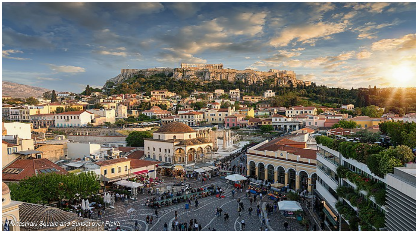
Monastiraki Square and Sunset over Plaka

Feel the echoes of 3,000 years of history as you explore the streets of Athens under the gaze of the Acropolis and its iconic Parthenon . The modern city wraps around the Acropolis hill, along with imprints left by Byzantine, Ottoman, and neoclassical influences. Whether you're touring some of Europe's greatest ancient monuments, walking alongside a guide through the trendy modern streets of Koukaki , Pangrati , or Keramikos and sampling the mosaic of food and drink along the way, or relaxing in the quietude of gorgeous green spaces like the National Garden , there's always something to delight you.